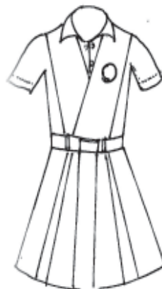
Diag (3) Girls : III - VI