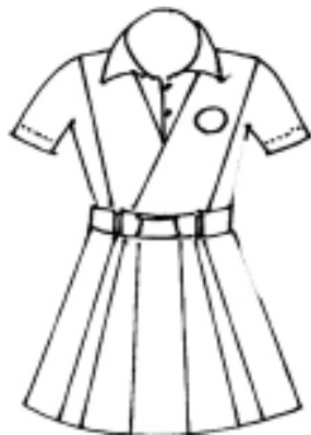
Diag (1) Girls - LKG & UKG